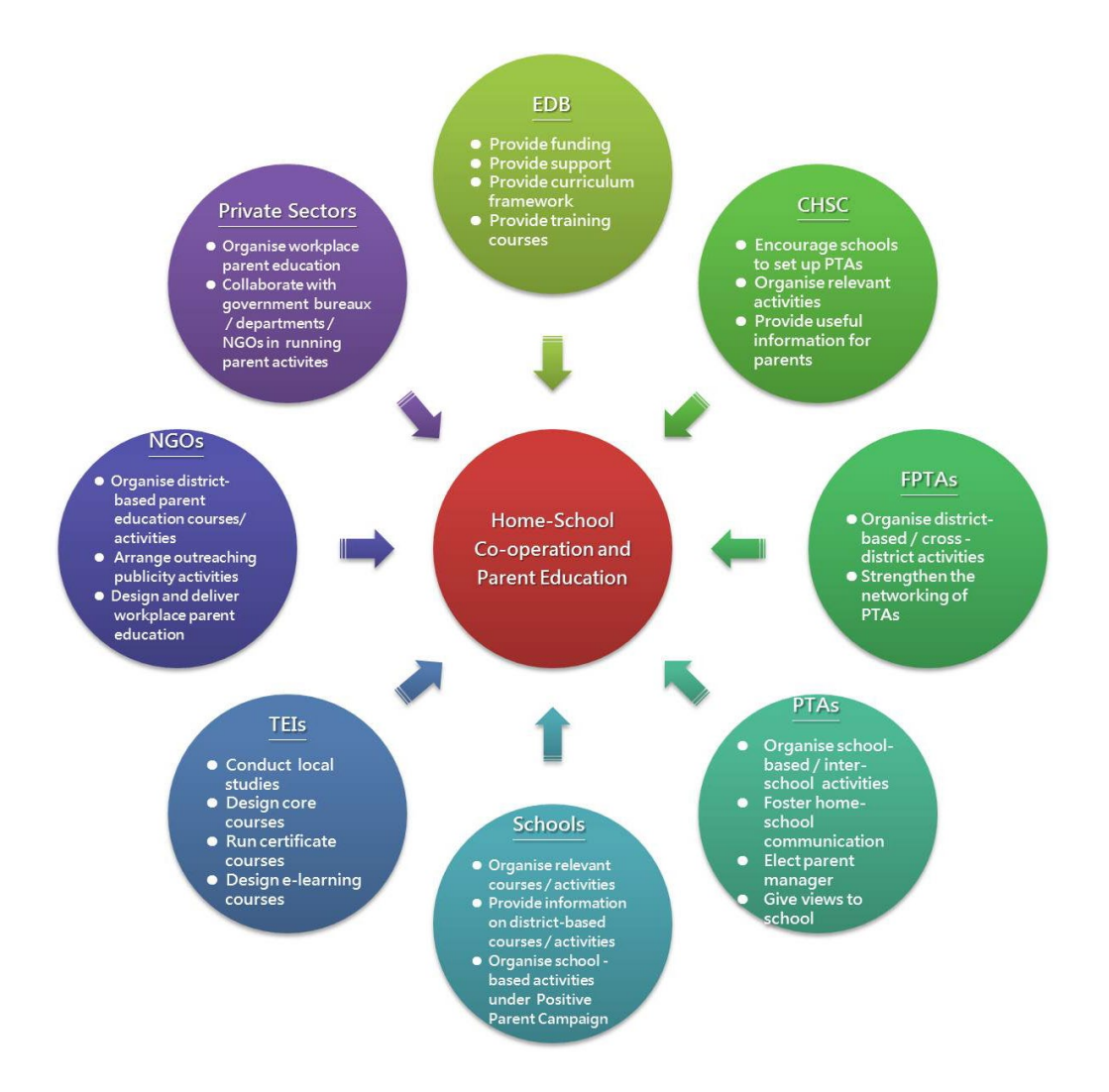
4.39 The Task Force recommends that the Government should draw on the expertise of TEIs and experts on parent education in developing the curriculum framework or curriculum guide for parent education, and borrow NGOs' experience of organising parent education courses in districts when designing and offering community-based parent education. The EDB may also collaborate with other government departments, such as the Department of Health and Social Welfare Department, to provide parent education for parents of different backgrounds. Moreover, the EDB may also collaborate with private organisations to provide parent education activities at workplace.

4.40 When soliciting the education sector's views on the promotion of home-school co-operation and parent education, the Task Force learns that though supporting the directions for strengthening home-school